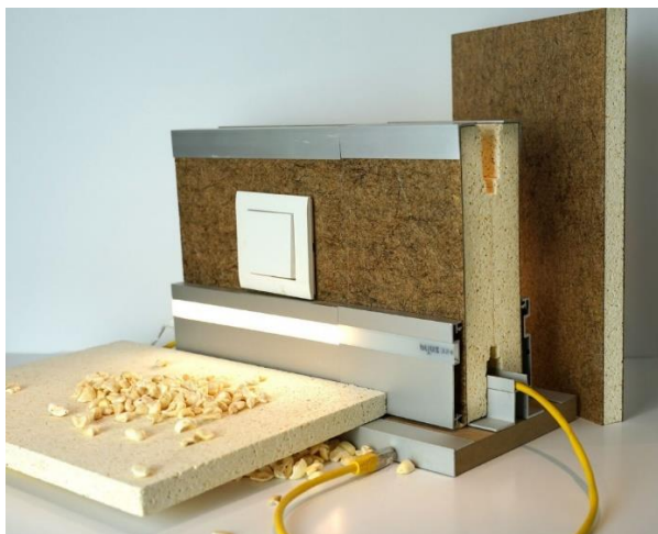
Popcorn granules - the ideal core material for panels made of natural fibre laminates.