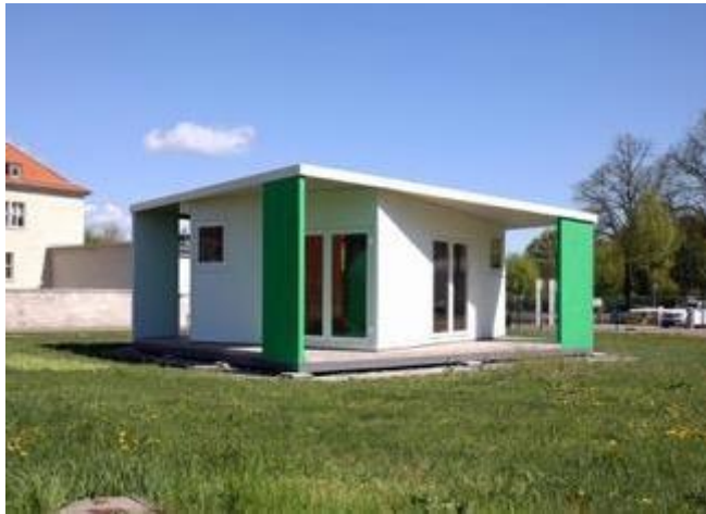
Show house of the Fraunhofer Institute in Halle (Saale), which was built from NCL panels in 2016 and shows no signs of weathering to this day.

Since 2016, a prototype house has been on display at the institute's premises proving how sustainable, simple, cost-effective and indefinitely declarable building can come together in the future. By acquiring a stake in C3 Technologies GmbH, SMARTER HABITAT has secured this innovative knowledge for transferring the process from laboratory scale to production-ready industrial manufacture of the composite panels.